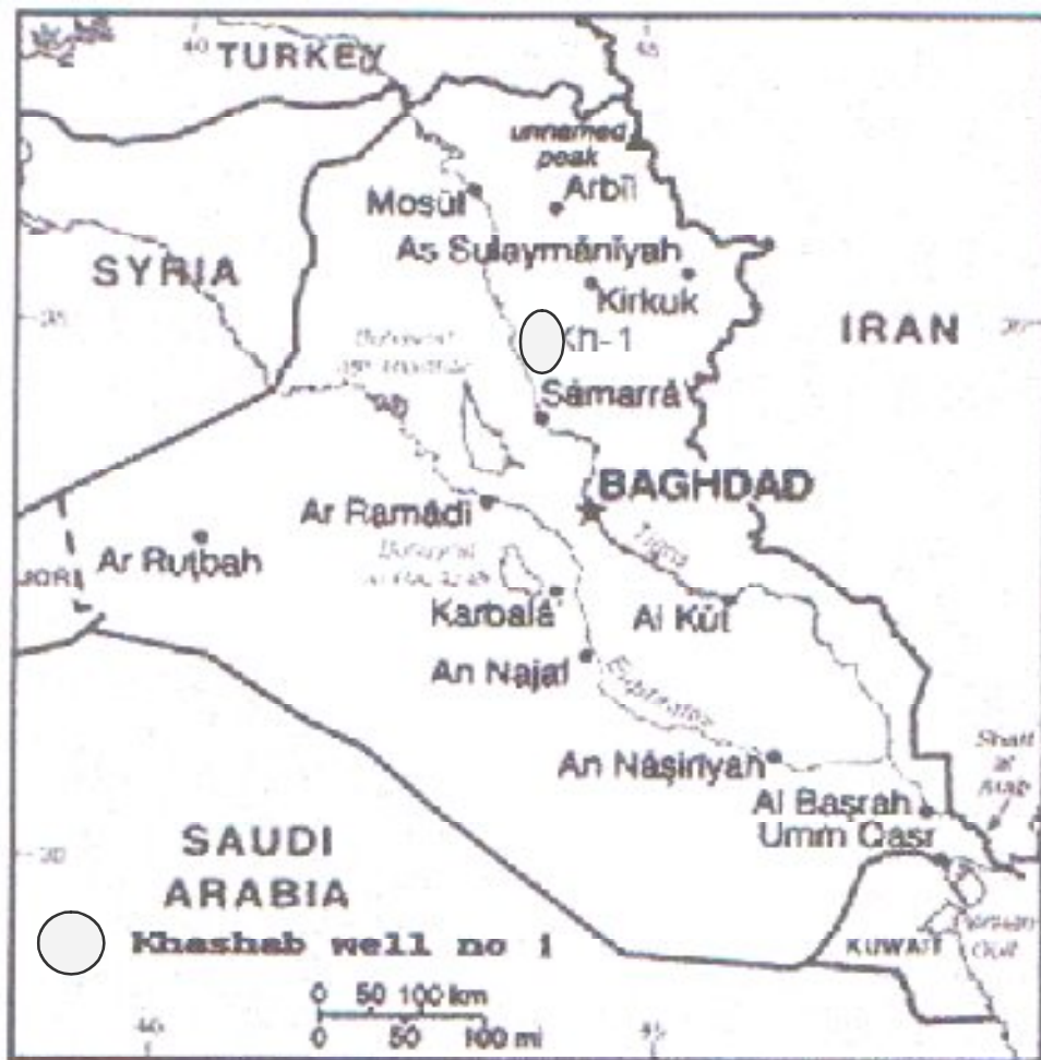
Fig.1 .Location map